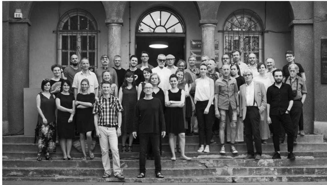
Staff of the Faculty of the Interior Design

The Faculty of Interior Design of the Academy of Fine Arts in Warsaw is the heir to a tradition dating back to 1905, when the Department of Applied Art was established at the Warsaw School of Fine Arts. Currently, we run full-time Master Degree studies and part-time studies: bachelor's and master's. Full-time studies are free of charge, and evening part-time, additional for working people, are paid.