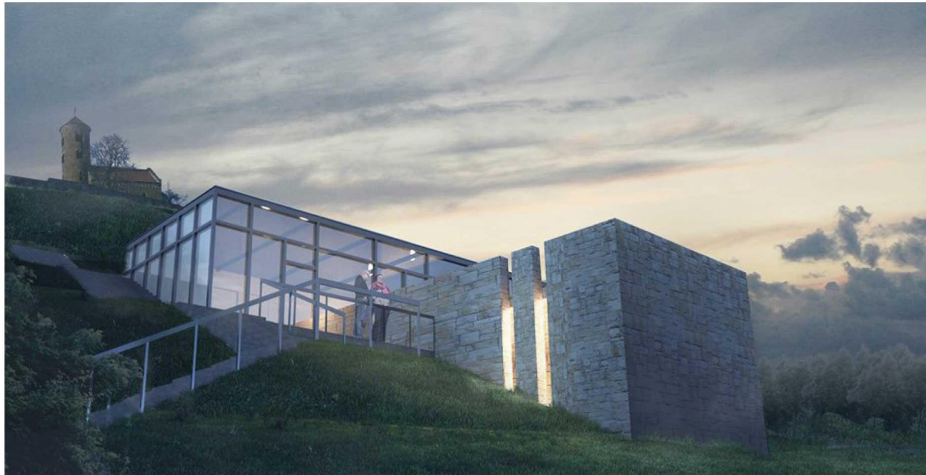
Pawilon informacyjny w Inowłodziu | Klaudia Kwiatkowska

Architectural Design is also an important subject - the topics of the tasks are: multi-family buildings, exhibition halls, galleries, museums, single-family houses, cafes, information points, pavilions, training and conference buildings. Building designs that our students make are always related to the subject of interior design. In addition to visualization, students also make technical drawings and models.