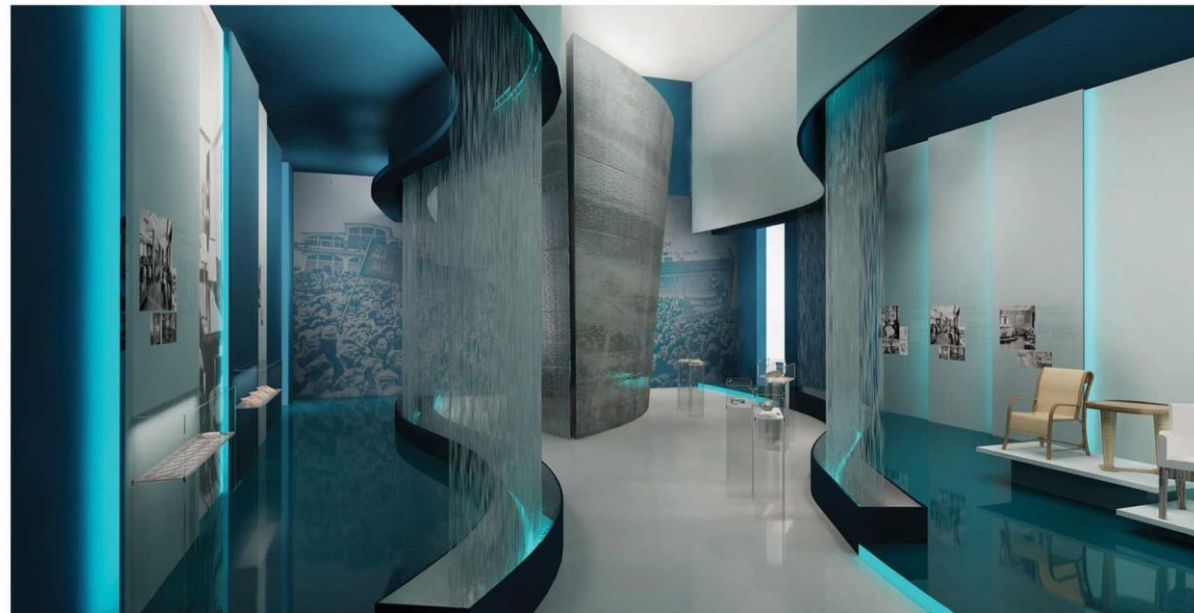
Projekt wystawy czasowej – „BATORY - kochały go tłumy - polski transatlantyk” | Joanna Tutka | Praca licencjacka |

One of the specializations is the design of exhibitions - both in open spaces, in museums and at fairs. The first stage of the student's project is the preparation of a substantive scenario: gathering information on a given topic, collecting reproductions of the presented photos, searching for exhibits. This is the basis for the author's search for the best solution for the space of an exhibition or stand. Students design original exhibition, installation and graphic elements.