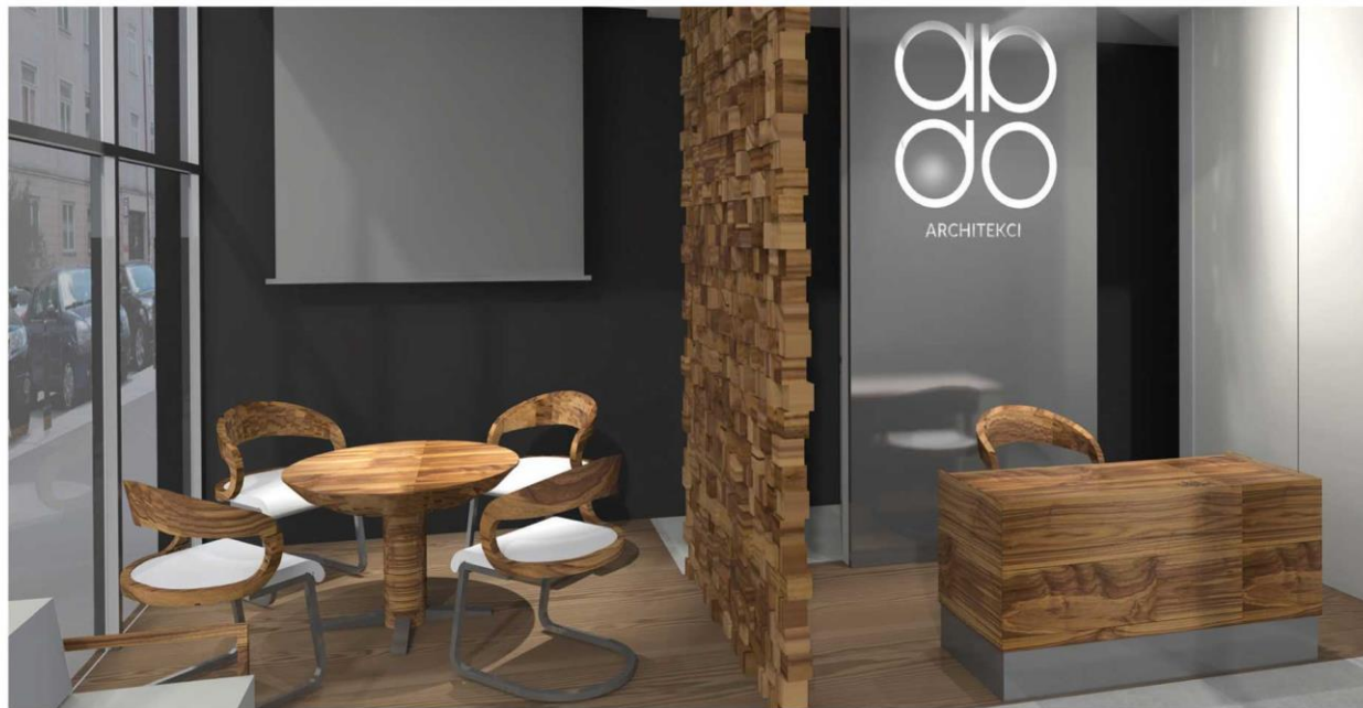
Projekt recepcji firmy architektonicznej | Paulina Żak

During the process of designing interiors, we try to achieve optimal results, finding a balance between design assumptions, the language of art and functional and technical solutions. Examples of tasks carried out in this specialization: reception desks, adaptation of a medieval monastery, youth club, adaptation of a former synagogue, tourist hostel, residential interiors, interiors of our Academy, headquarters of a railway IT company, residential interiors, railway station, library, cinema, interiors of hotels and resorts.